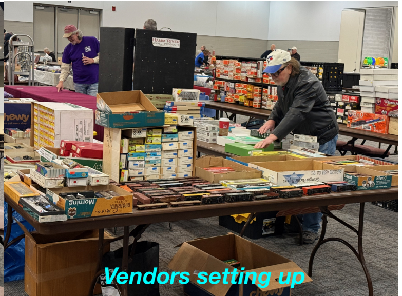
Vendors setting up