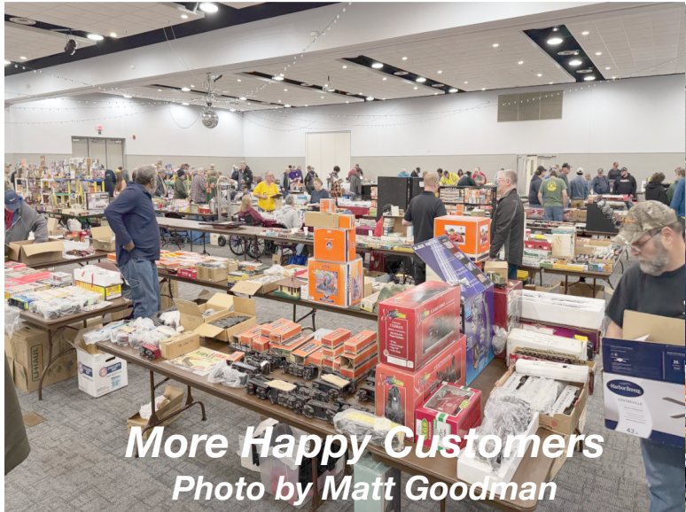
More Happy Customers