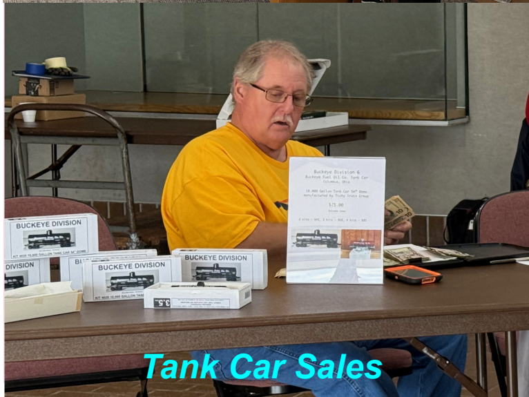
Tank Car Sales