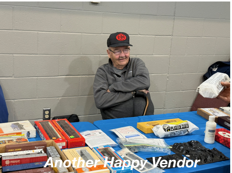
Another Happy Vendor