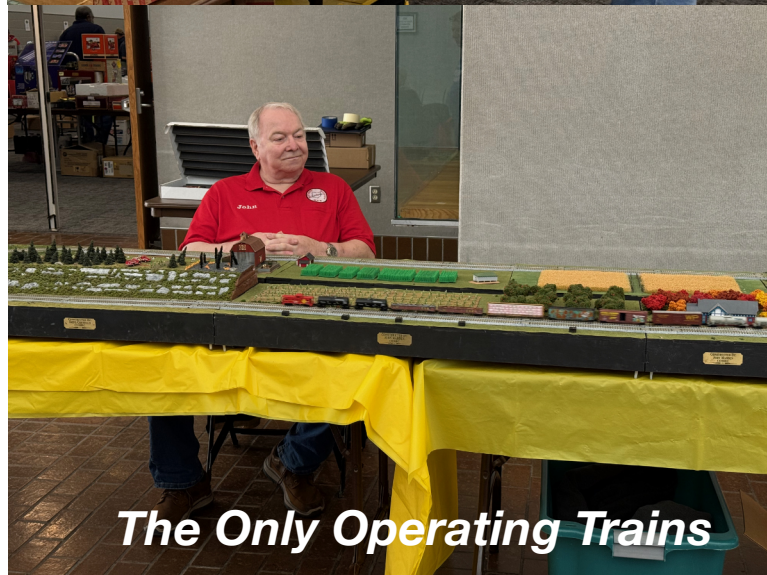
The Only Operating Trains