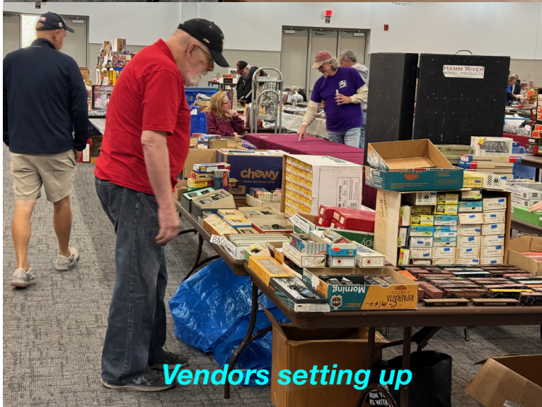
Vendors setting up