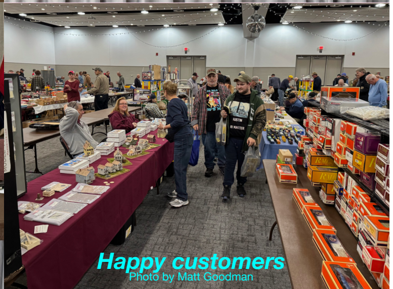
Happy customers