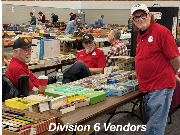
Division 6 Vendors