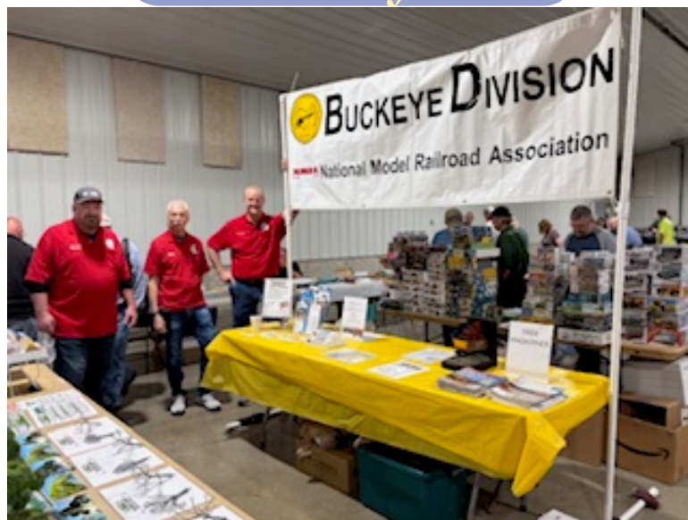
Buckeye Division display at the Lancaster Train Show